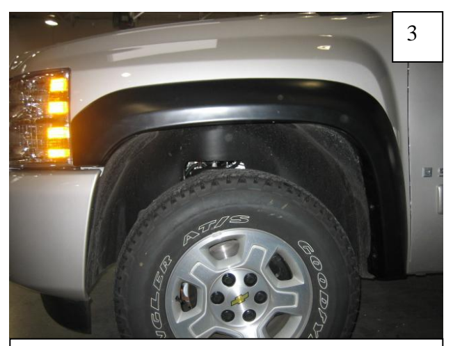
Verify fit and tighten all screws.