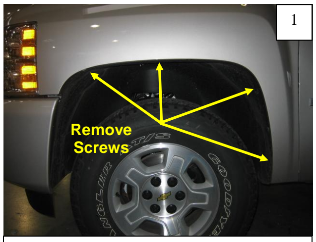
Using a 7mm socket, remove four factory screws. Retain screws for later use.