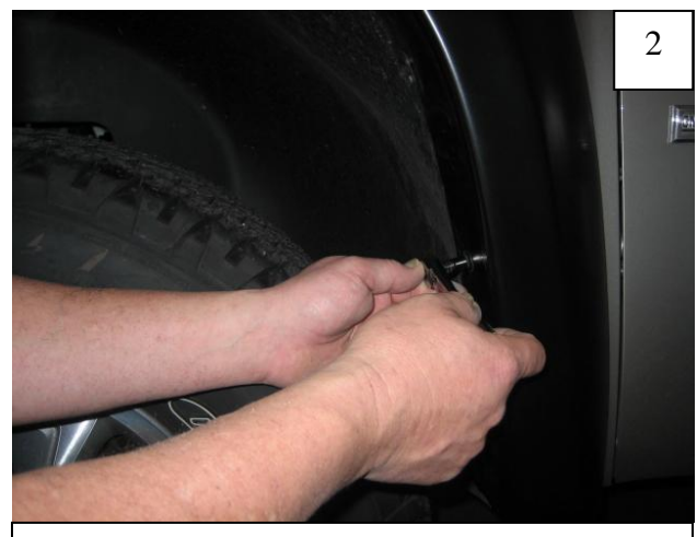
Position flare on fender, and reinstall four factory screws removed in Step 1.