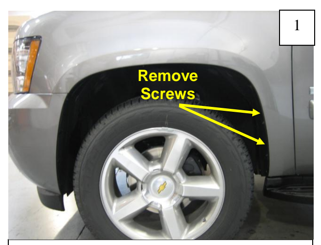
Using a 9/32" socket, remove two factory screws. Retain screws for later use.