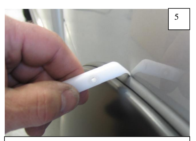
Using supplied Edge Trim Tool, seat edge trim against vehicle by hooking curved end under edge trim at one end of flare and slide around outer edge of flare to the other end.