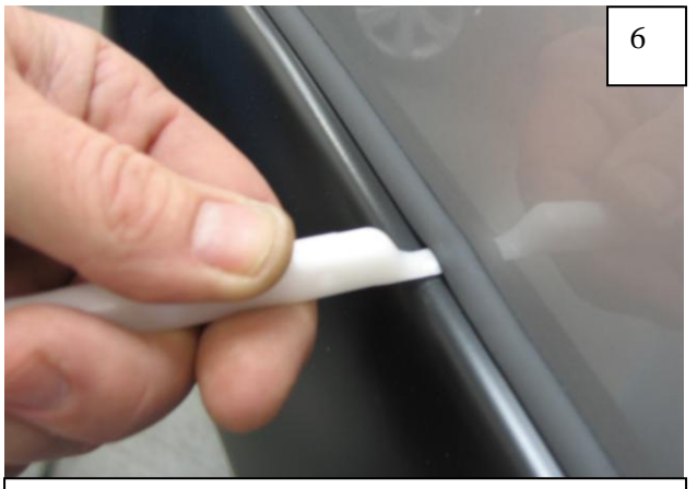
Using flat end of supplied Edge Trim Tool, seat edge trim against flare by inserting straight end between edge trim and flare at one end and slide around entire edge to the other end.

BUSHWACKER FENDER FLARES TRUCK FENDER FLARES