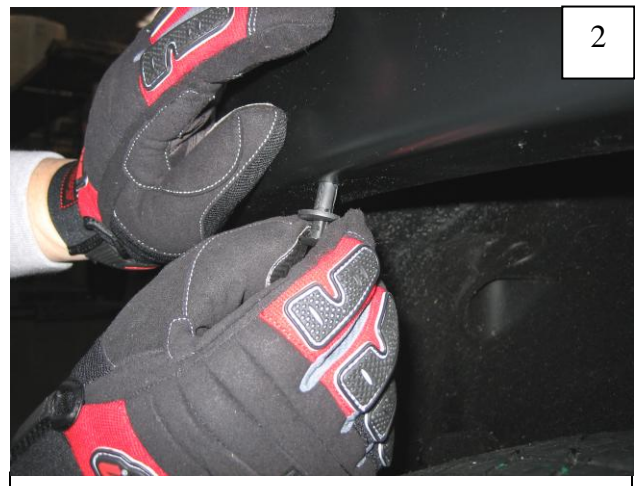
Holding flare in position on fender, install two supplied Plastic Tuf-loks.