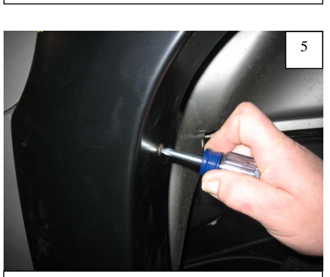
Reposition flare on fender. Start a supplied serrated-flange screw through the hole in the flare, and into each clip.