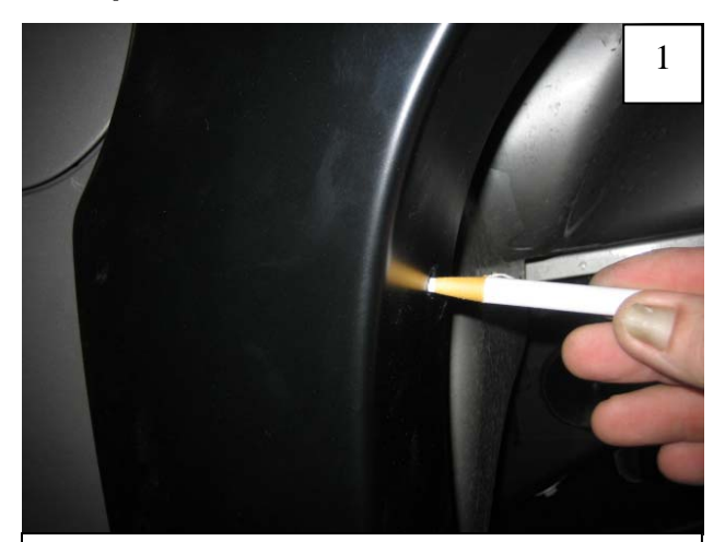
Holding flare in position on fender, use a grease pencil to mark six hole locations.