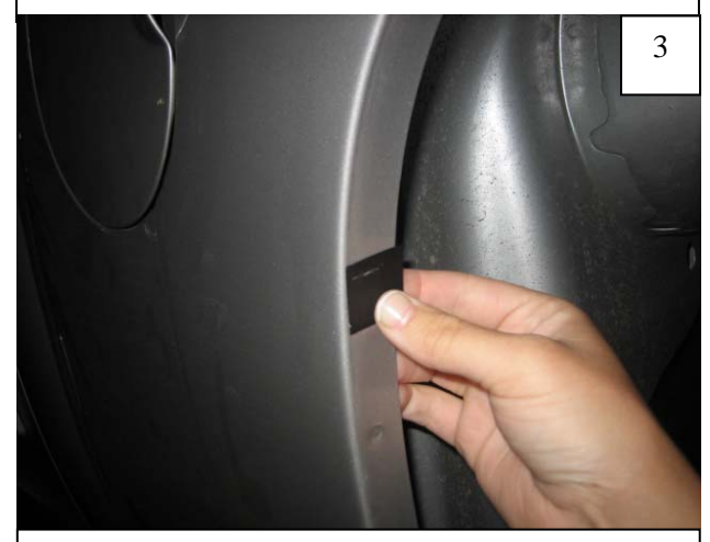
Center a supplied black plastic tab over each mark made in Step 1, aligning edge of tab with inside of fender lip (tab may extend over outside of fender).