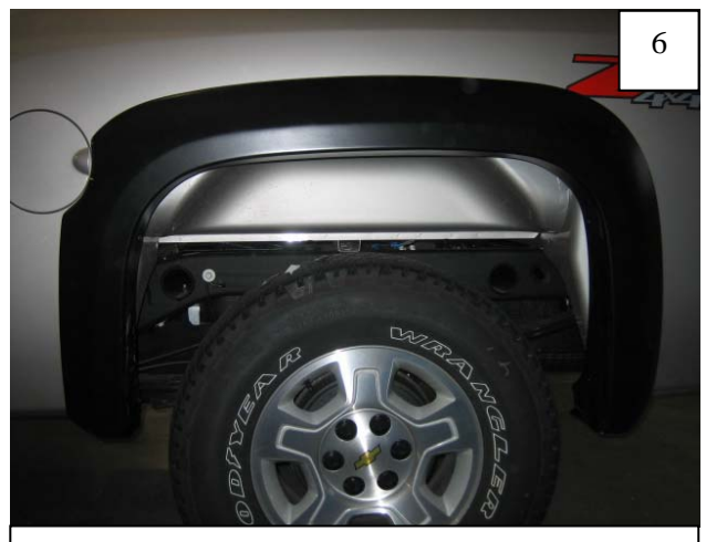
Verify fit and tighten all screws.