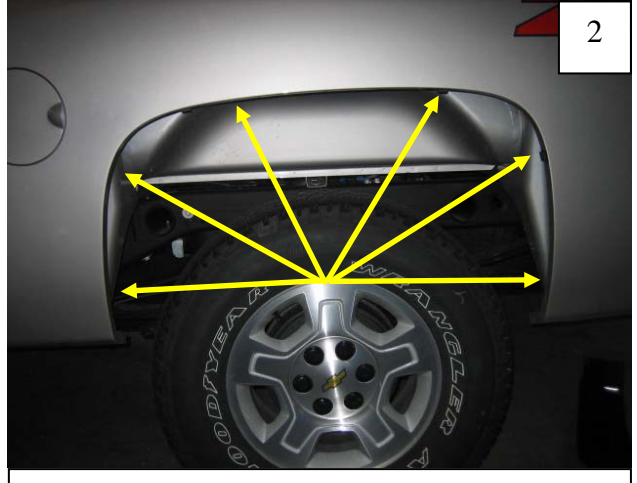
Six hole locations.