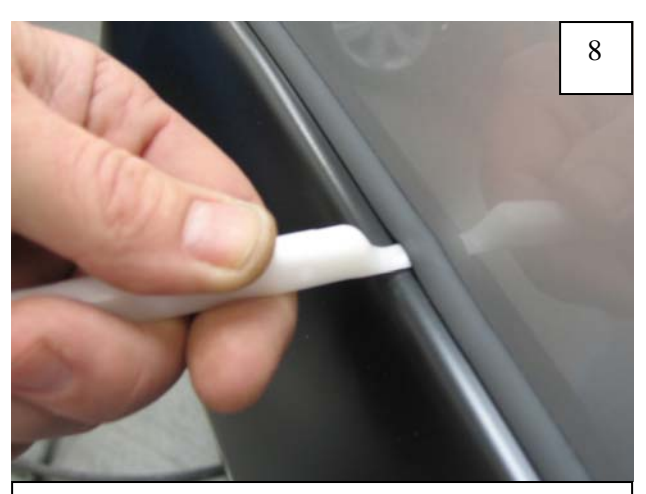
Using flat end of supplied Edge Trim Tool, seat edge trim against flare by inserting straight end between edge trim and flare at one end and slide around entire edge to the other end.

BUSHWACKER FENDER FLARES TRUCK FENDER FLARES