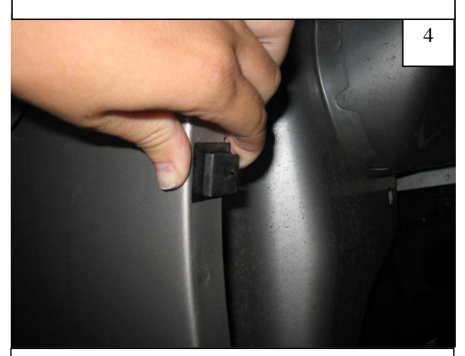
Slide a supplied clip over each black tab. Clips may need to be adjusted to align with holes in flare.