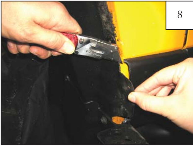
Using a utility knife, cut splash guard flush with edge of sheet metal also.