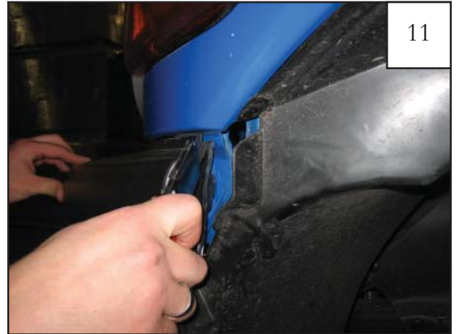
Trim remaining plastic flush with bumper.