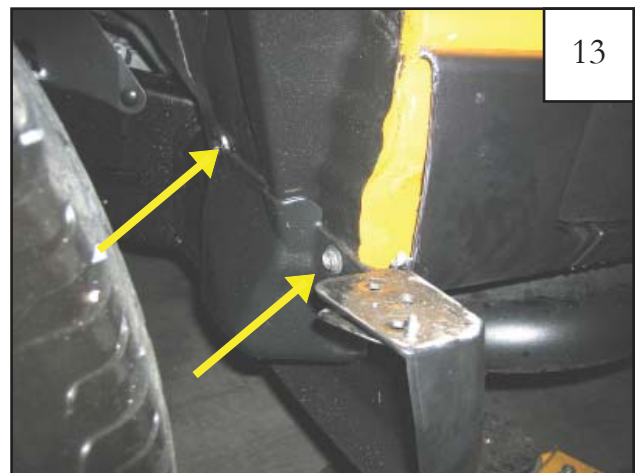
Remove mud flap bolts as shown (2 places).