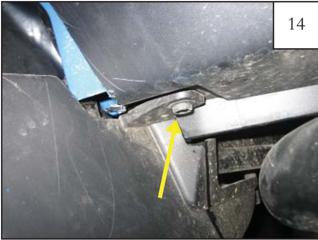
Remove third mud flap bolt, and remove mud flap.