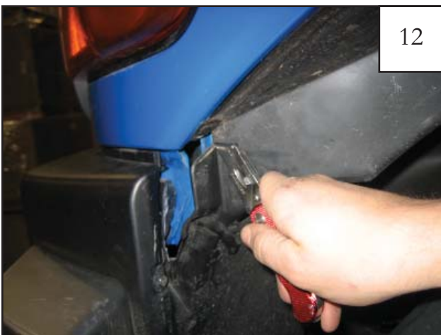
Trim plastic tab along seam.