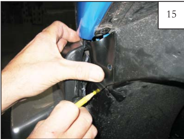
Holding Front Inner Piece on front of wheel well next to bumper, use a grease pencil to mark two clip locations.