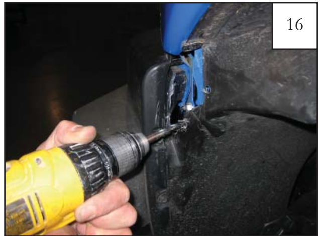
Remove Front Inner Piece, and drill two 5/16" holes on marks made in previous Step (2 places).