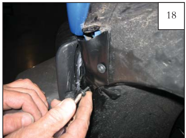
Position Inner Front Piece on vehicle, aligning holes in part with holes in Clips installed in previous Step. Install supplied Screws (SW1-0056).