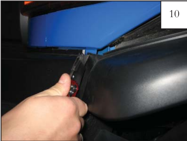
Cut front of factory flare along bumper, taking care not to cut bumper.