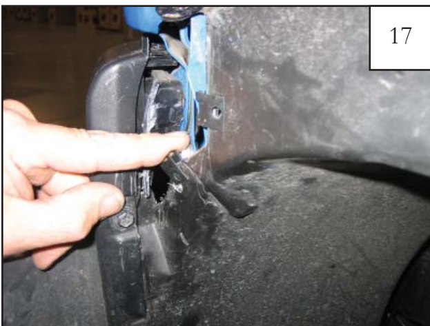
Slide supplied Clips (CL1-0022) over holes drilled in previous Step (2 places).