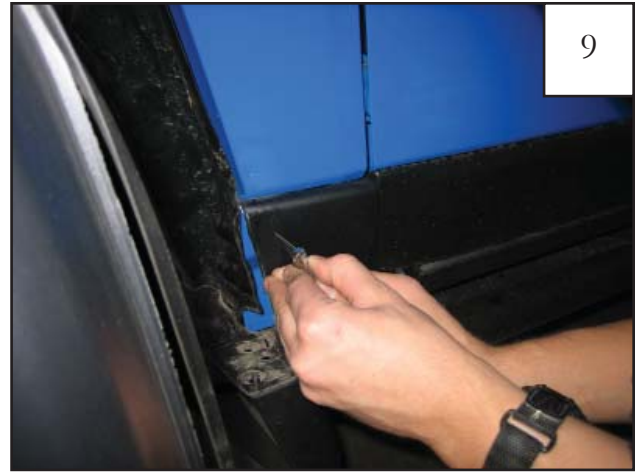
Trim an additional 3/4" from rocker, so that end of rocker is within confines of sheet metal. NOTE: The Flare will cover this area to 1/4" from the door seam.