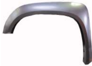
Passenger Side x1