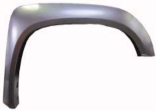
Driver Side x1