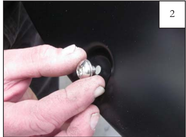
Put each Bolt through a pocket hole in the flare, bolt head on the outside.