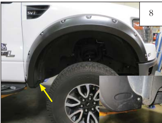
Re-install factory screw in hole at the bottom rear of the flare and into the factory hole.