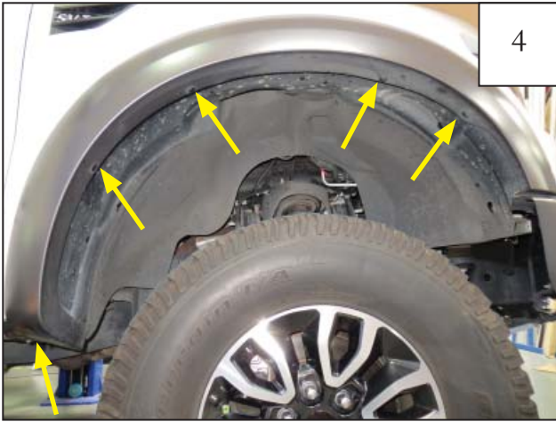
Using a pry tool, remove 5 retainers from the factory flare. Discard factory retainers.