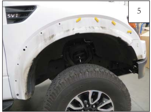
Carefully pull factory flare away from fender and remove. Using pliers, remove factory plastic clips. Clean the fender area.