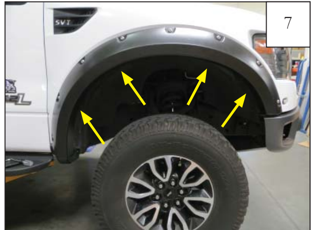
Position flare on fender and install supplied push retainers (RV1-P001) through holes in flare and into factory holes. (4 places)