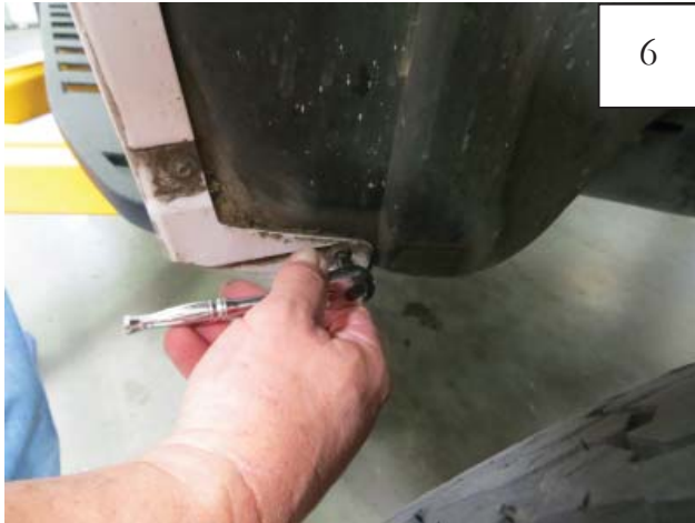
After removing factory flare, use a 7/32 socket to remove the factory screw located at the bottom rear of the wheel well. Retain screw for re-installation.