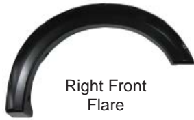
Right Front Flare