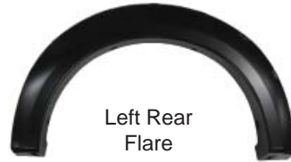
Left Rear Flare