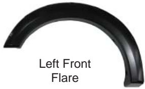
Left Front Flare