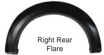
Right Rear Flare