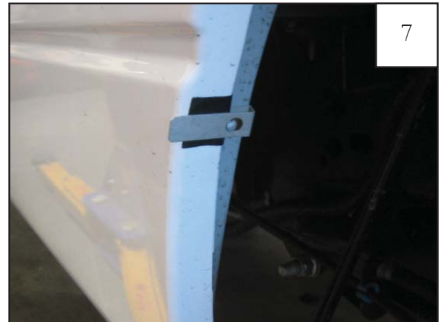
Install a Clip (CL1-0009) over each of the six Tabs (MT1-0014) placed on the sheet metal in Step 6.