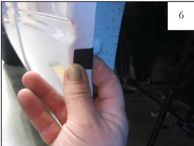
Wrap a Tab (MT1-0014) around the wheel well sheet metal, centered over each of the six marks made in Step 5.