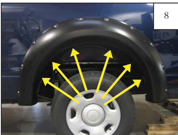
Hold flare to vehicle and start Screw (SW1-0058) through the two topmost holes in wheel well. Then start Screws through remaining four holes in flare. Tighten all Screws.