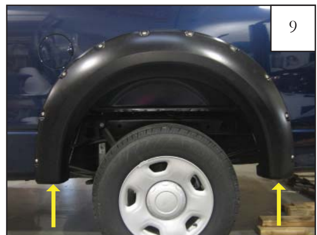
Using a 10 mm socket wrench, reinstall factory bolts.