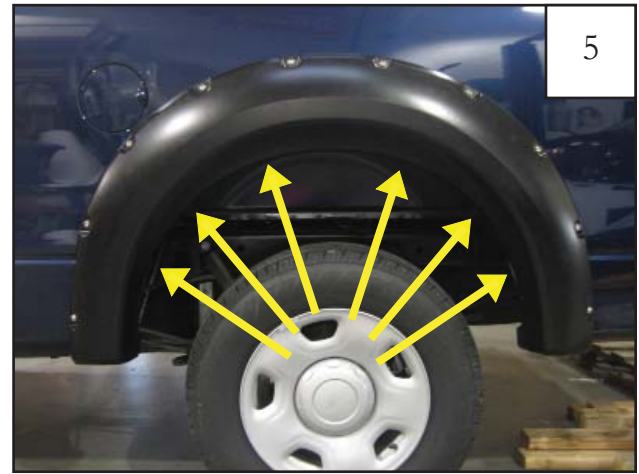
Hold flare to vehicle and mark the location with a grease pencil of the six holes in the flare.