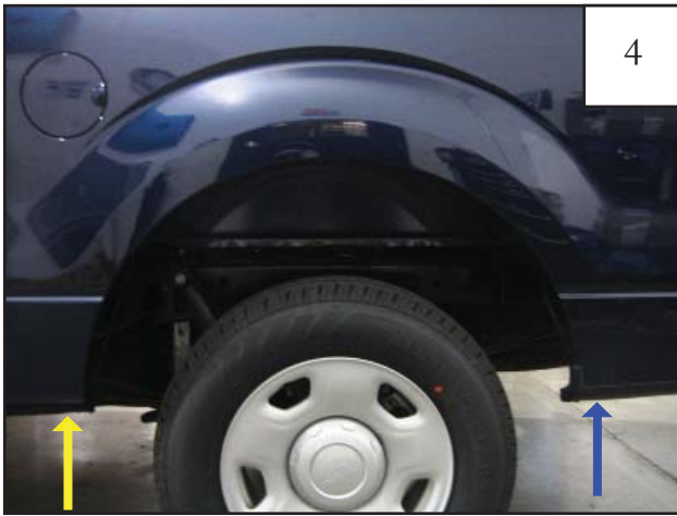
Remove two factory bolts with a 10 mm socket wrench. Save for reinstallation.