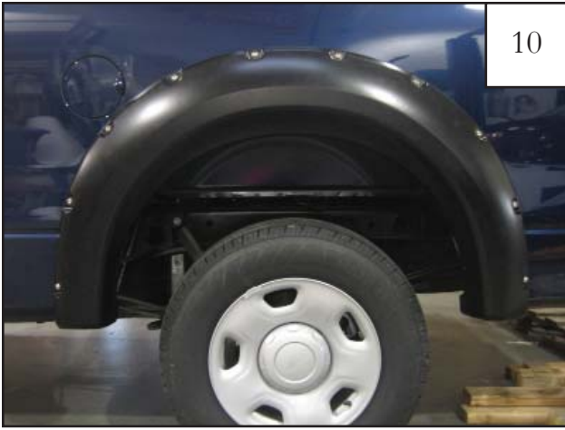
Completed rear flare installation.