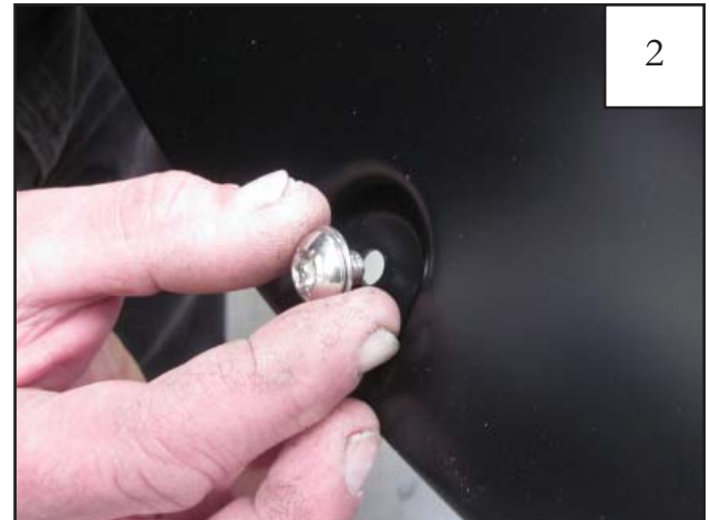
Put each Bolt/Washer combination through a pocket hole in the flare, Bolt head and Washer on the outside.