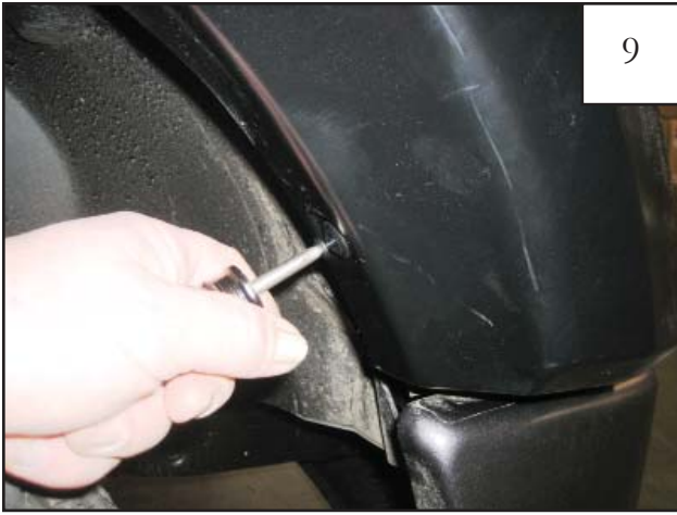
Still holding flare to fender, install tuflocks using a Phillips screw driver. See step 10.