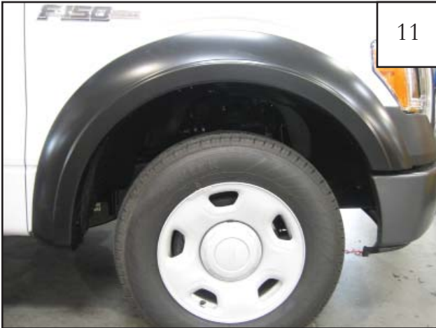
Completed front flare installation.