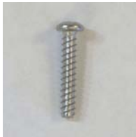
Plastite Screw (4 per)