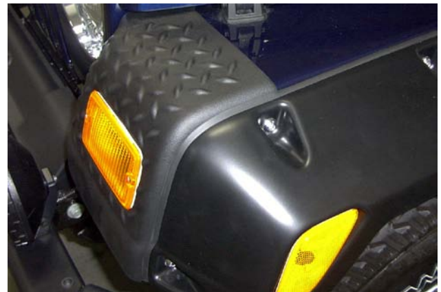
Photo #4 – Front Corner edge is under new Bushwacker Wiper-Style Edge Trim