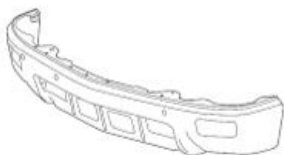
2014 - 2015 Chevrolet Front Bumper 22944857

The first thing you need to look at is quality. Option 2 is a genuine part. That entitles it to a better warranty and guarantees with fitment. Option 1 didn't set off any alarms that it might be a cheap knock-off. The reviews I saw were mostly positive. However, that is something to be aware of. All the effort of getting the bumper replaced will be wasted if the part rusts after your first winter.