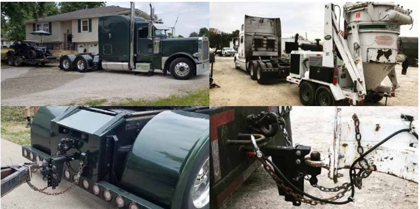
TRACTOR TRAILERS EQUIPPED WITH EXTREME DUTY HITCHES