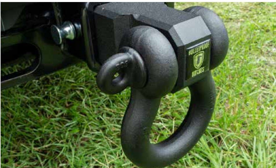
FORD F-350 WITH 3" RECEIVER SHACKLE

2" Part number: ED20SHACKLE • 2.5" Part number: ED25SHACKLE • 3" Part number: ED30SHACKLE