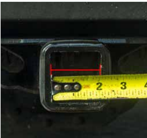
FIG. A (BELOW)

To find out which BulletProof Hitch will work best for your application, please follow the steps below.