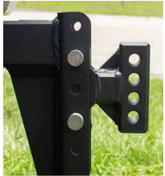
BULLETPROOF HITCHES WEIGHT DISTRIBUTION ADAPTER WITH WEIGHT DISTRIBUTION HEAD ATTACHED