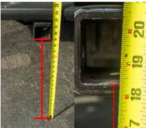
FIG. B (BELOW)

If you are unsure or have questions, please contact us and we will assist you.