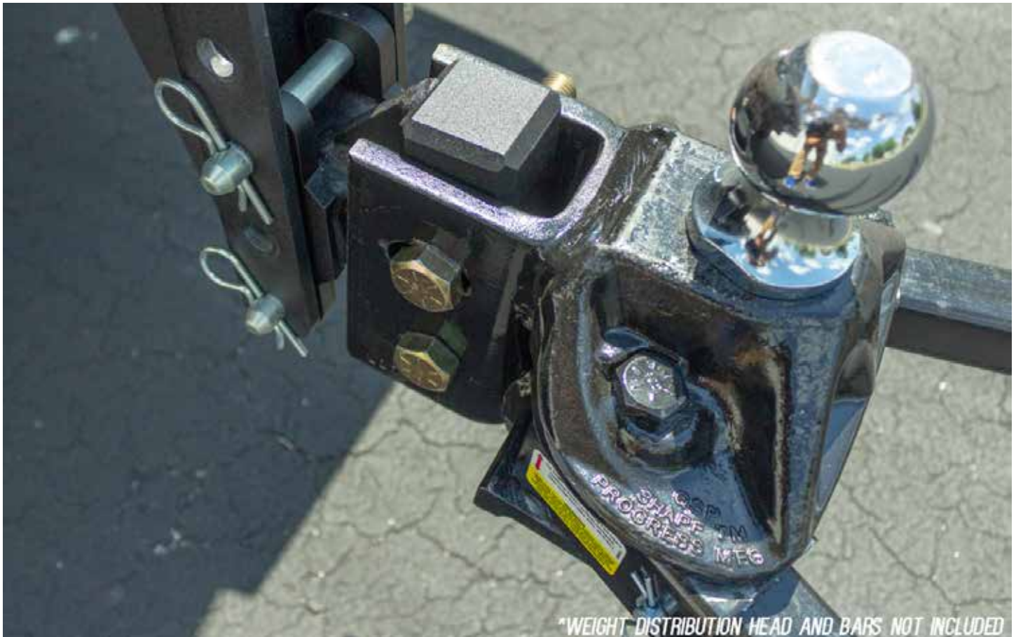
*WEIGHT DISTRIBUTION HEAD AND BARS NOT INCLUDED