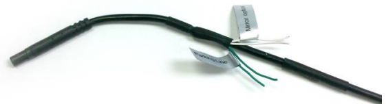
Green and White wires on the Camera Harness

Display options: Default setting is mirror image display (i.e., words and letters appear backwards as in a mirror) for rearward facing camera (rear view) installation. To change to forward facing camera (front view), connect the two white wires near the end of the camera harness.