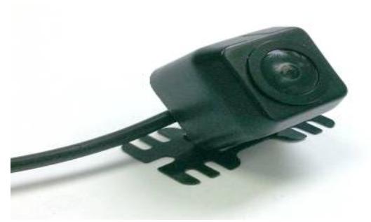
Alternate Camera Mount Bracket

Place camera in desired position to confirm fitment (Note: Some states prohibit items blocking the license plate; check local authorities to confirm legal status for your application).