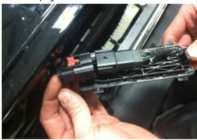
Step 3: Run the new camera harness through the opening in the back of the bed to the underside of the vehicle.