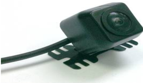
Alternate Camera Mount Bracket

Place camera in desired position to confirm fitment (Note: Some states prohibit items blocking the license plate; check local authorities to confirm legal status for your application).