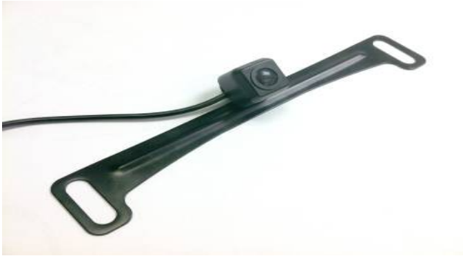
License Plate Bracket

Determine which of the two supplied camera mounting methods you prefer.