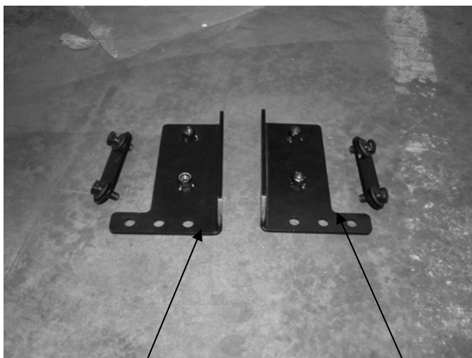
Driver side bracket