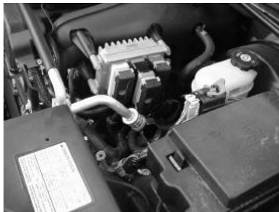
Fig # 6 installation complete

Have fun with your new power from JET Performance Products