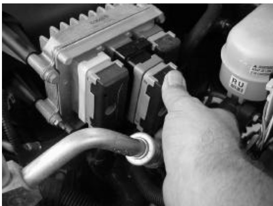
Fig # 5 reinstalling factory harness