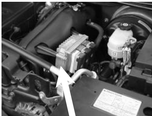
Fig # 1 ECM