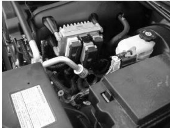
Fig # 6 installation complete

Have fun with your new power from JET Performance Products