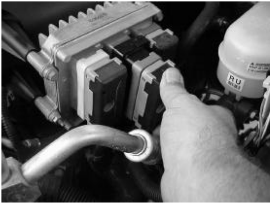
Fig # 5 reinstalling factory harness