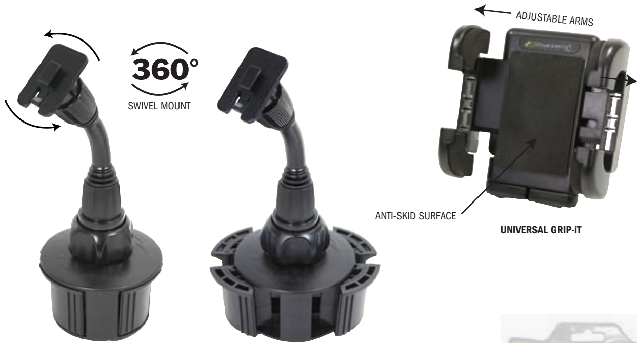
UNIVERSAL CUP-iT BASE EXPANDS TO FIT CUP HOLDERS UP TO 3.75" IN DIAMETER