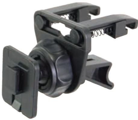
360° ROTATING AIR VENT MOUNT

SECURE YOUR PORTABLE DEVICE IN SECONDS. USE WITH MOST ELECTRONIC DEVICES.