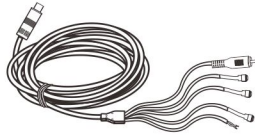
B Camera Extension CableX1