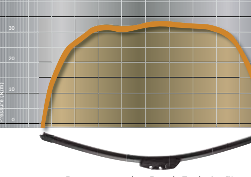
Pressure graph – Bosch Evolution™