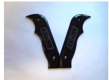
Gearshift Handle Grip Plates