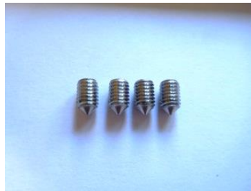
10-32 x 5/16" Cone Point Set Screw (4)