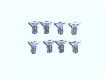
6-32 x 5/16" Flat Head Screw (8)