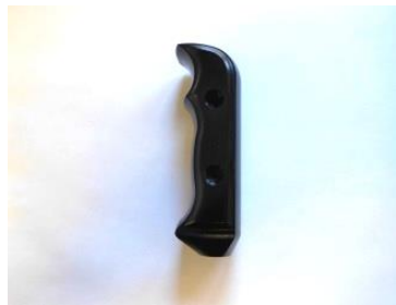
Transfer Case Handle