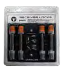
BX88177 4-Lock kit (2) 5/8" and (2) 1/2" for Baseplate 2" Rec.