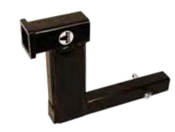
BX88132 10" Rise/Drop, 5,000 lbs, 11-1/2" long