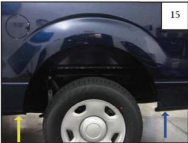
Remove two factory bolts with a 10 mm socket wrench. Save for reinstallation.