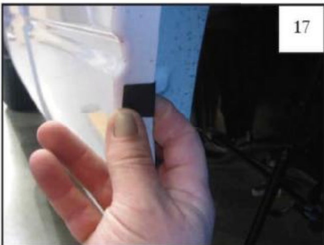
Wrap a Tab (MT1-0014) around the wheel well sheet metal, centered over each of the six marks made in Step 16.