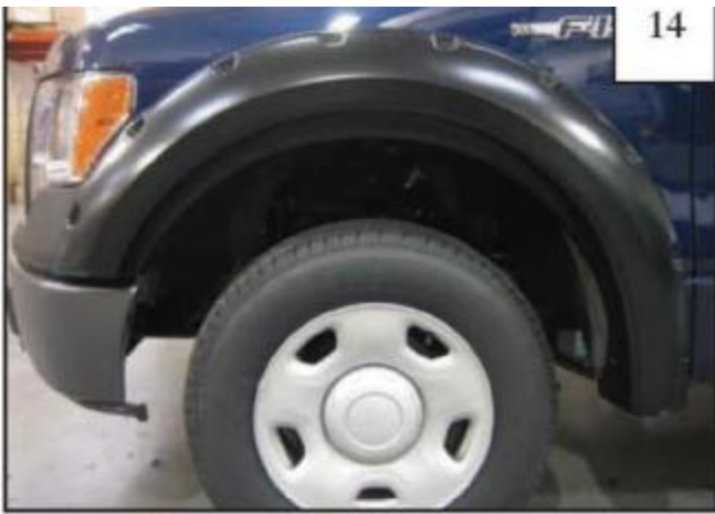
Completed front flare installation.