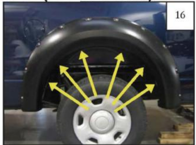
Hold flare to vehicle and mark the location with a grease pencil of the six holes in the flare.