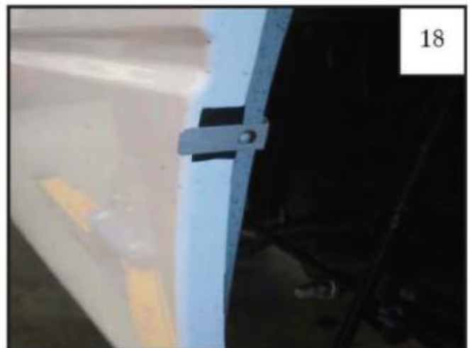
Install a Clip (CL1-0009) over each of the six Tabs (MT1-0014) placed on the sheet metal in Step 17.