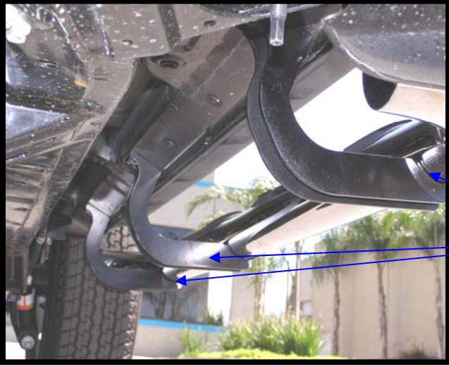
FIG. #2 DRIVER SIDE SHOWN