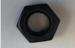
Figure IV m8hex nut