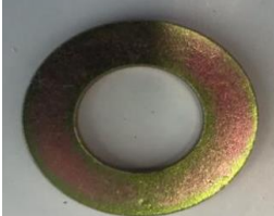
Figure V Flat Washer