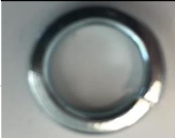
Figure VI lock Washer