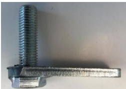
Figure III m8 T-Bolt