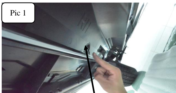
Remove the mud flap

Step 3: Refer to the following picture to install the front bracket with T Bolt 2, then insert T Bolt 1 refer to Pic 2. Fix the bracket with (8), (9) and (10).