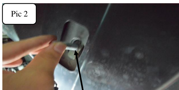
Insert the T Bolt

Step 4: Refer to Pic 3 to install Middle Bracket. Fix with (15) (16) (13) (14).