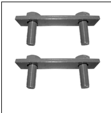
Bolt Plates ( The picture only for reference)