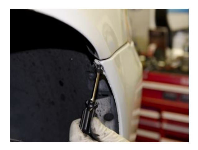
6. Using the T45 Torx bit, remove the six crash support bolts (three on each side)to loosen the lock carrier.

4. Remove the bumper screws on the edge of each side of the bumper. Pull the bumper edges away from the car, towards the front of the car.