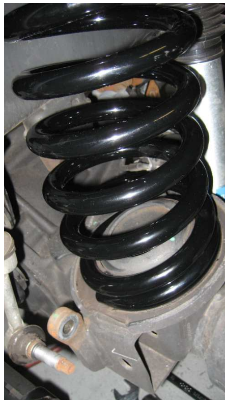
Figure 7. Driver side (pictured with 5112 kit)