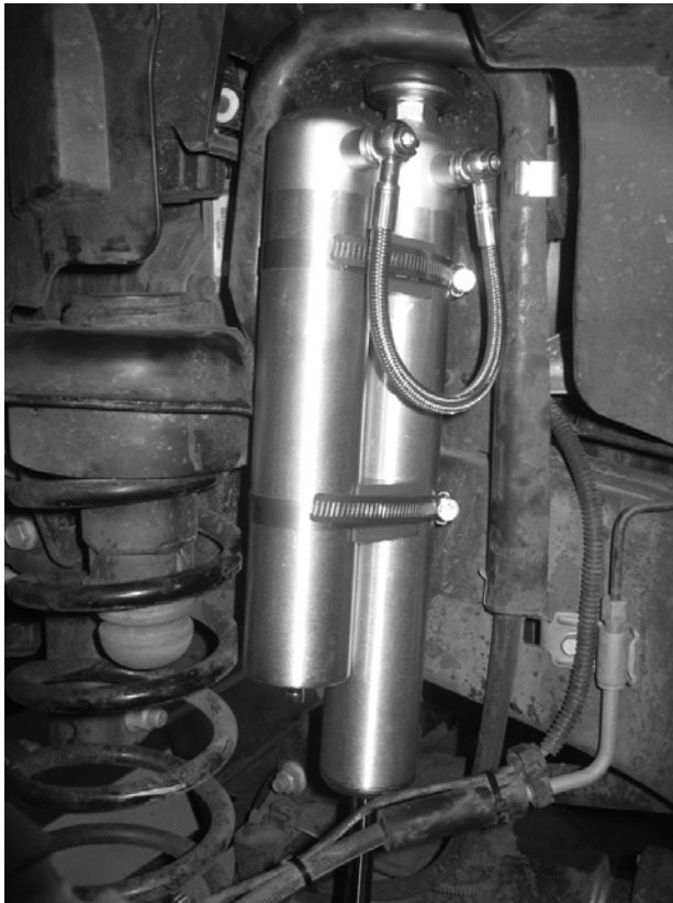
Figure 1. front driver side