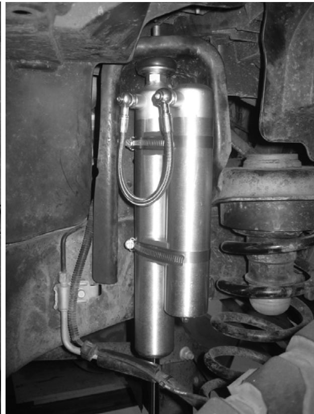
Figure 2. front passenger side