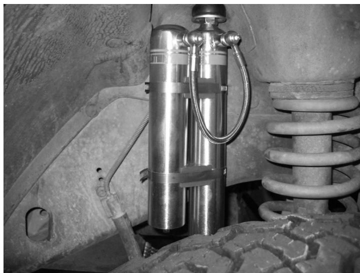
Figure 2. front passenger side