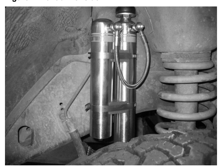
Figure 2. front passenger side