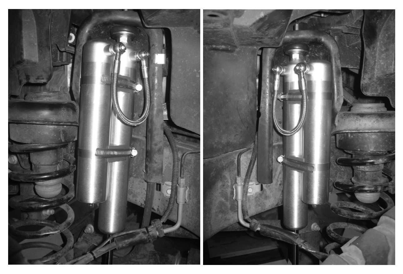
Figure 1. front driver side