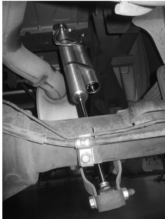
Figure 5. rear passenger side