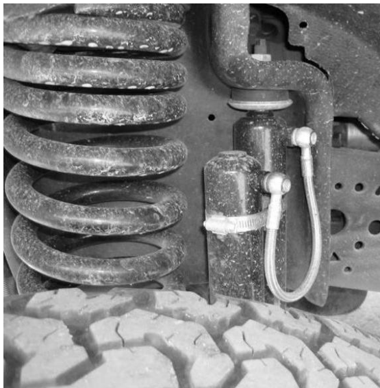
Figure 3. front driver side

Note: The shocks and hardware depicted herein may differ slightly in appearance from the supplied components.