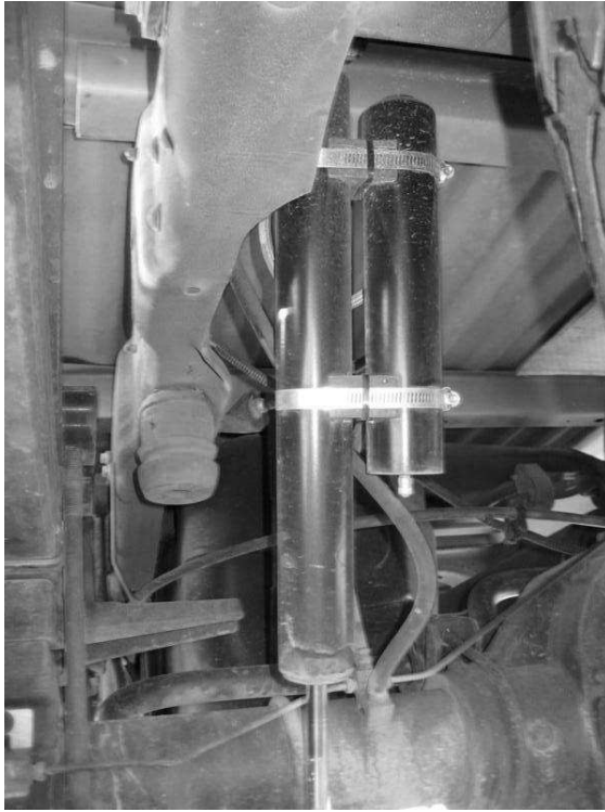
Figure 3. rear driver side