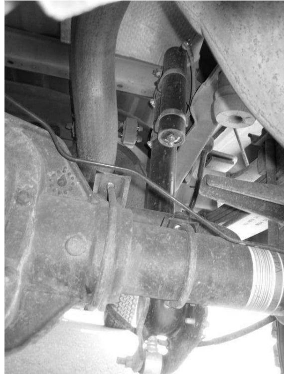
Figure 4. rear passenger side