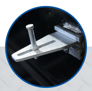
SELF ADJUSTING STRIKERS

The patented welded C-channel adds substantial rigidity to the lid, while being foam-filled means excellent sound deadening.