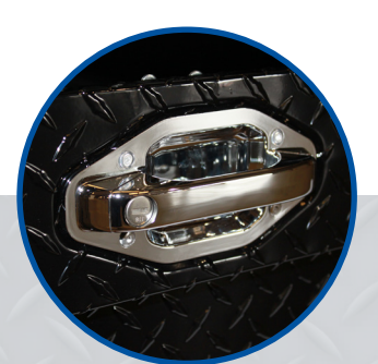
LOCKING CHROME PULL HANDLES

Industry exclusive locking pull handle latches allow you to lock or unlock your box from either side.