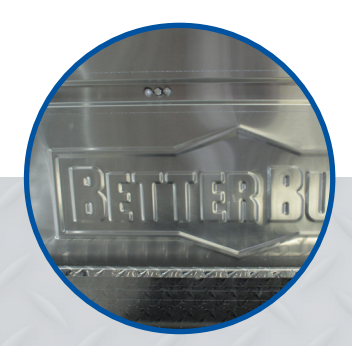
DURABLE LID DESIGN

Industry exclusive locking pull handle latches allow you to lock or unlock your box from either side.