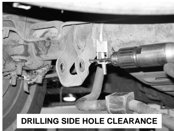
DRILLING SIDE HOLE CLEARANCE