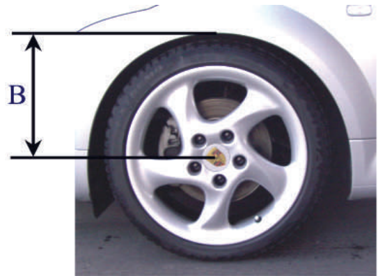
Measurement B Wheel hub center wheel arch

Please enter the adjusted height of the modified car into the list: