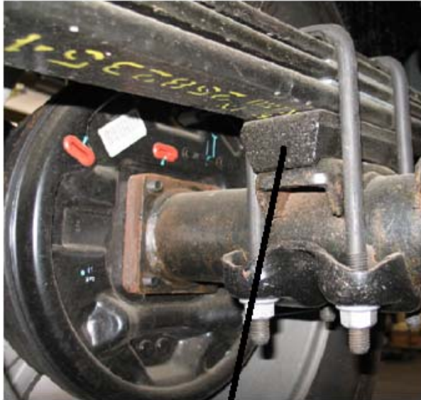
TOP SPACER BLOCK