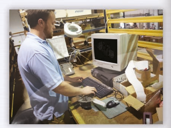
Product team working to determine the needed enhancements to make the installation of a particular part easier on the technician.

Beck/Arnley's filter kit gaskets are made from NBR rubber for flexibility in climate changes. They hold up better in heat and cold, and there is less chance of leakage. In addition, bolt holes are smaller to help the technician during installation. This helps hold the bolts in place.