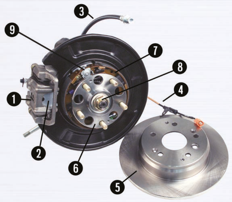
Rear Disc Brake Assembly