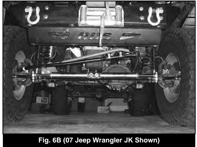
Fig. 6B (07 Jeep Wrangler JK Shown)