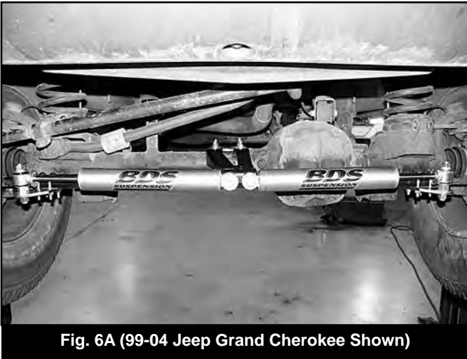
Fig. 6A (99-04 Jeep Grand Cherokee Shown)