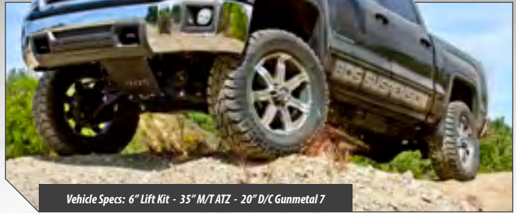
Vehicle Specs: 6" Lift Kit - 35" M/T ATZ - 20" D/C Gunmetal 7