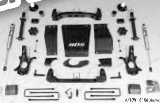
#710H - 6" Kit Shown w/ Optional FOX 2.0 Shocks