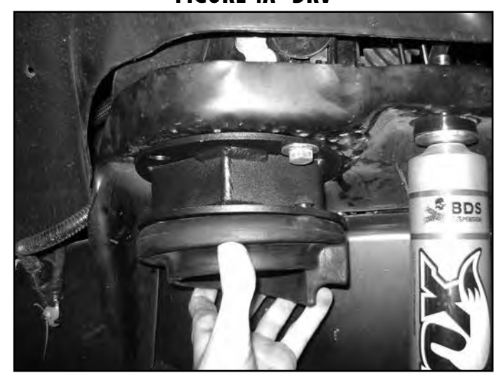
FIGURE 4A - DRV