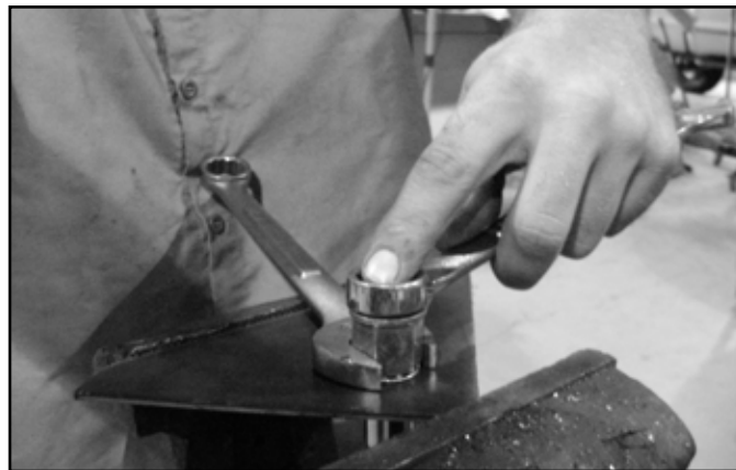
FIGURE 4 - 1/2" RIVET NUT INSTRUCTIONS