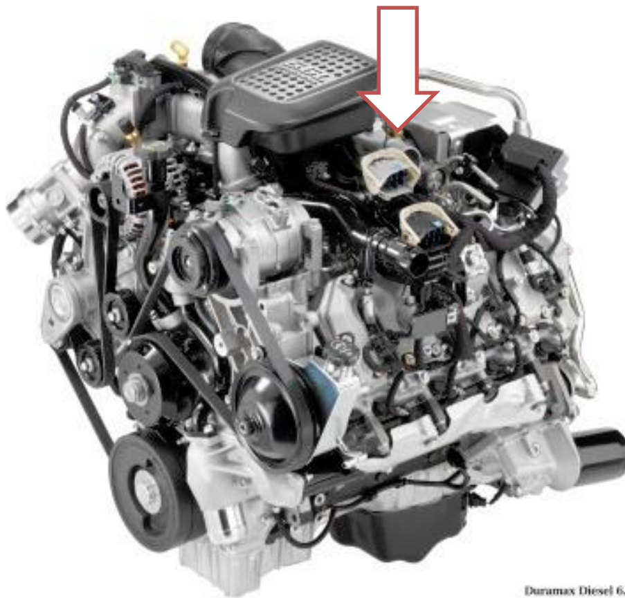
GMC Sierra HD