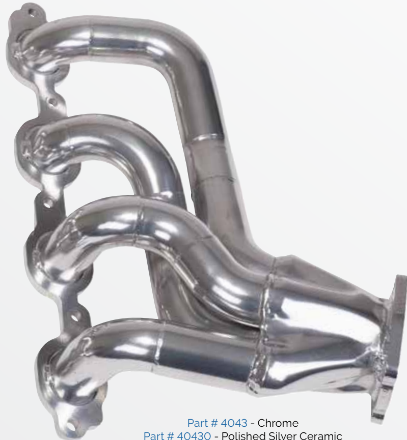
Part # 4043 - Chrome Part # 40430 - Polished Silver Ceramic