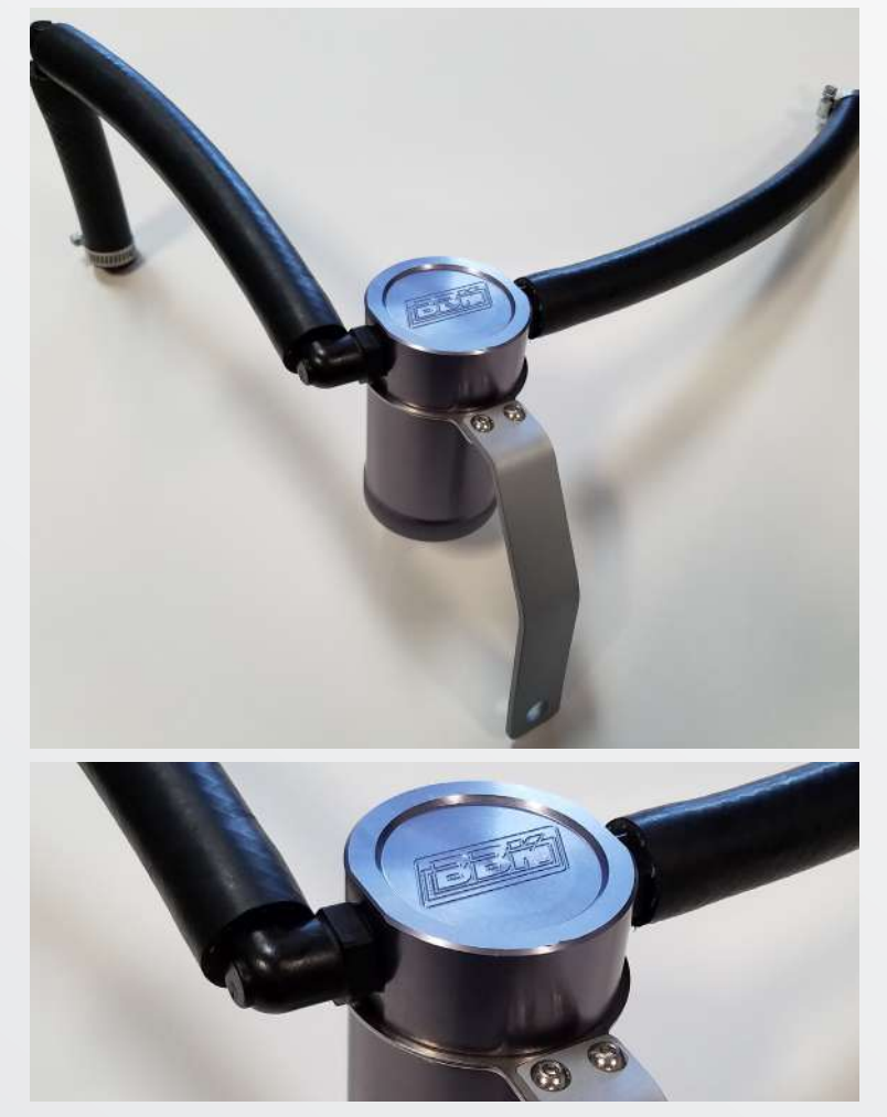
Now assemble complete oil separator kit as shown in picture. Making sure to use the two supplied hose clamps at valve cover and intake manifold connections only.